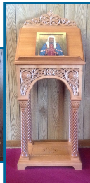
New Liturgical Items: Hand-carved icon stand in the narthex.