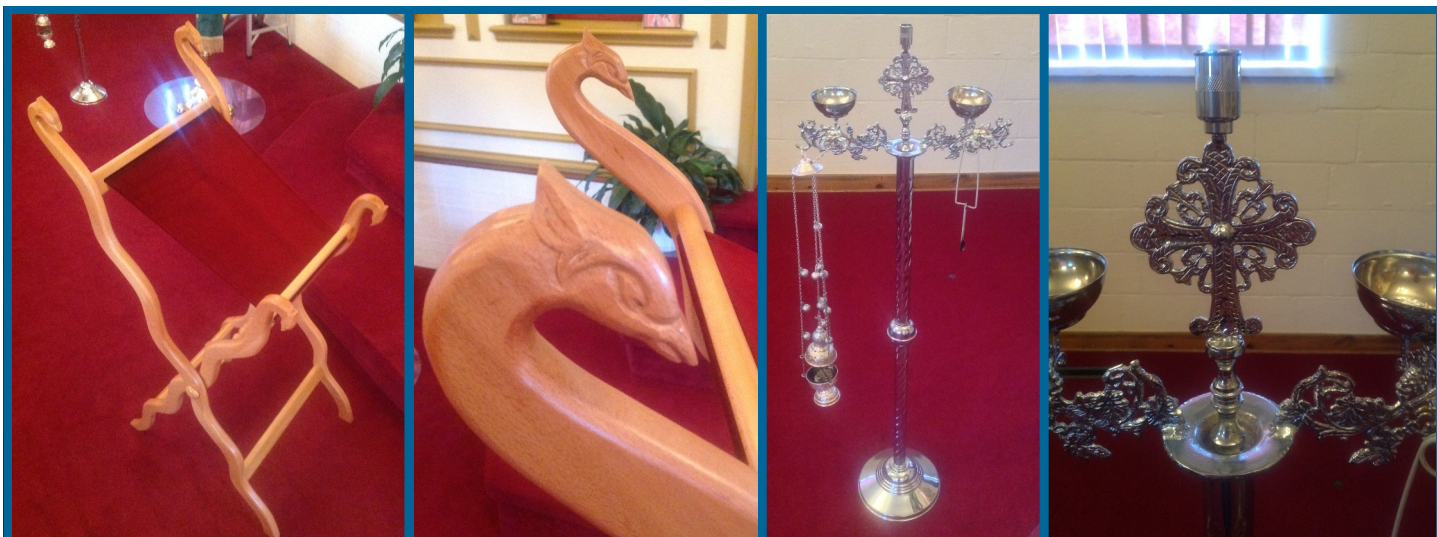
New Liturgical Items (from l. to r.): Monastic-style gospel stand; gospel stand carving detail; censer stand; censer stand detail.

Dates for the festival are August 22, 23 and 24. Volunteer sign up sheets are out for your sign up in the Church Hall. The sheets cover our needs starting on August 16 for Sam's Club purchase of supplies (loading the U-Haul and unloading at the Church); August 18 thru August 21, AM to PM times for putting up the canopies, receiving a shipment of food from Denver, packaging desserts, preparing the meatballs and cutting tomatoes, onions and salad items. The festival times of operation (including setup) are 9am to 9pm (Friday), 9am to 10pm (Saturday) and 9am to 7pm (Sunday). You can sign up at the Church or contact our festival coordinators. Stephen Bolish (Volunteer Coordinator): sbolish [at] gmail.com and Norm Struck : nstruck40 [at] yahoo.com — 719.360.6844. This year a T-Shirt was designed for our festival and we now have them available for early purchase at the Church on Sundays after services. —Norm Struck, Fundraising Director